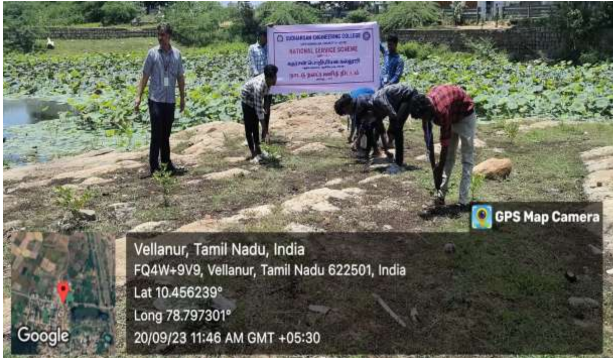
Our NSS volunteers actively participated in “Temple Pond Cleaning” activity at Alagu Natchiamman Temple, Vellanur